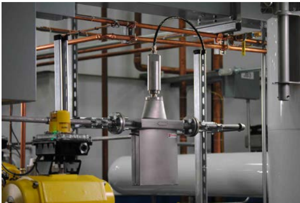
Figure 3: Coriolis flow meters are designed to directly measure fluid mass over a wide range of temperatures with a very high degree of accuracy.