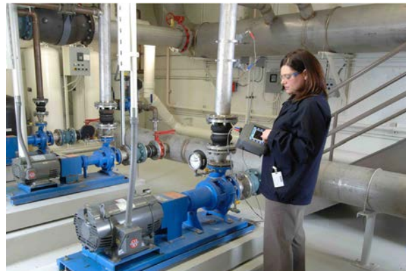
Figure 4: Clamp-on ultrasonic flow meters can be used for troubleshooting a wide range of flow issues, from verifying the reading of another meter to monitoring flow systems over an extended time period.