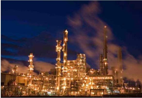
Figure 1: Leading chemical companies have recognized the importance of sustainable manufacturing practices.