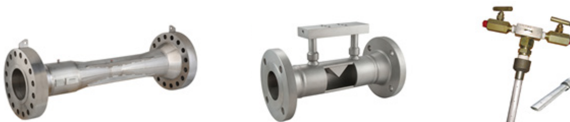
Figure 3: Each DP approach has its place when optimizing flow measurements in plant processes.

Most CPI users are familiar with orifice plate-based flow measurement. The following are some of the higher-performing techniques that are available for differential pressure flow measurement. Each approach has its place when optimizing flow measurements in plant processes (See Fig. 3).