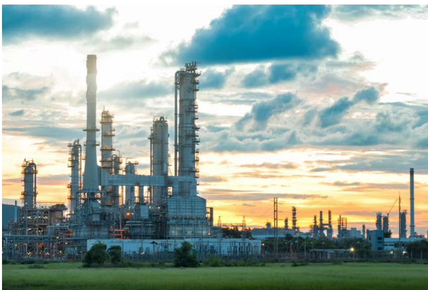
Figure 1: Most chemical processing plants have two primary flow measurement challenges: accuracy and cost.

Most chemical processing plants have two primary flow measurement challenges: accuracy and cost. The goal is to correctly match the right flow meter to the right application to achieve the best performance for the lowest purchase price and total cost of ownership (See Fig. 1).