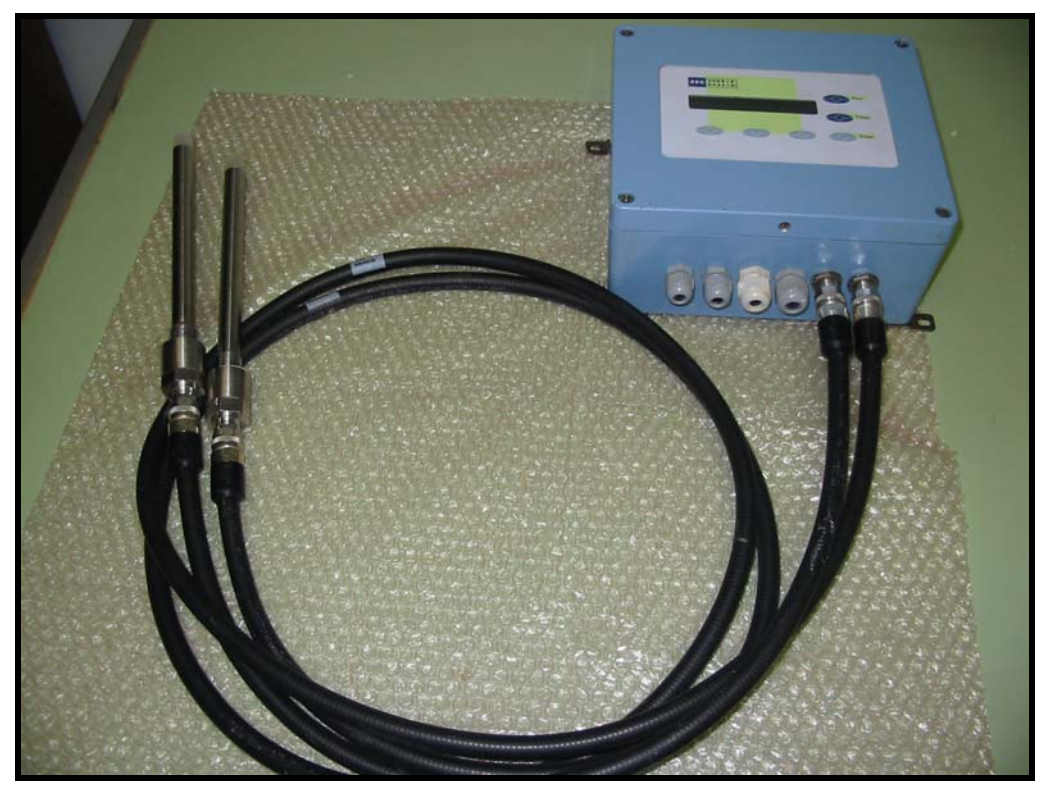
TECO HK-1M Modular Unit

Thompson Equipment Company 125 Industrial Avenue New Orleans, LA 70121