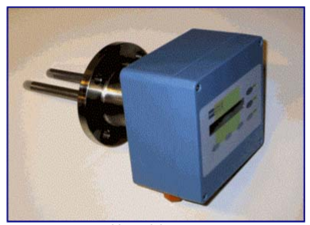
TECO HK-1C Compact Unit