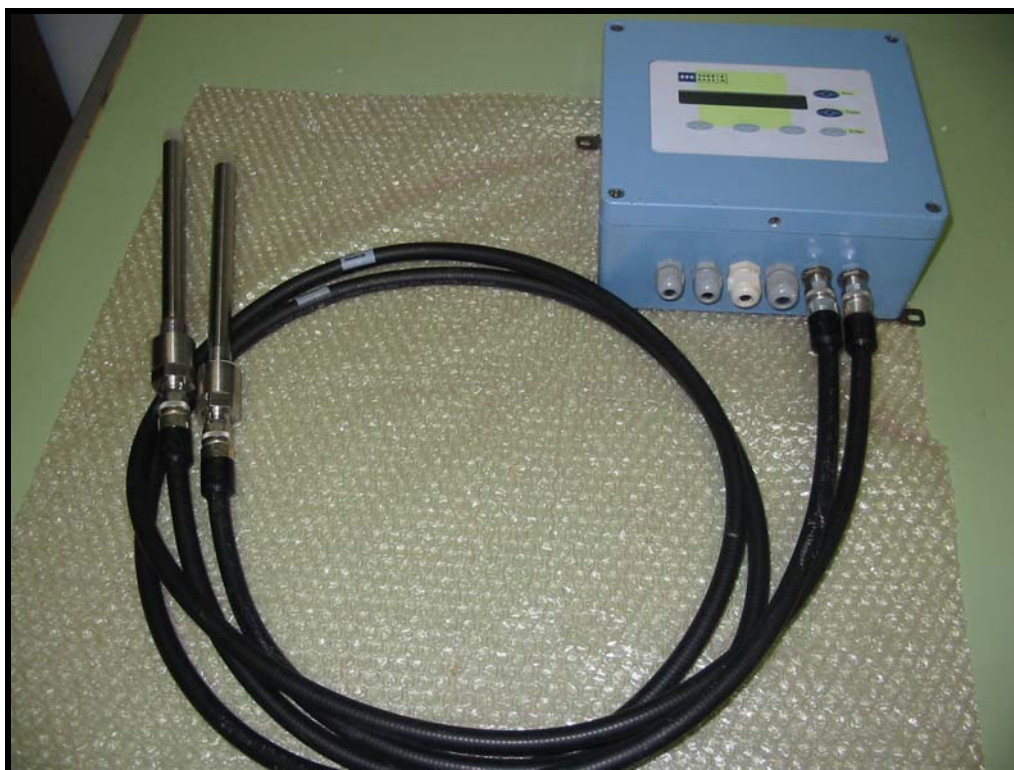
TECO HK-1M Modular Unit

Thompson Equipment Company 125 Industrial Avenue New Orleans, LA 70121